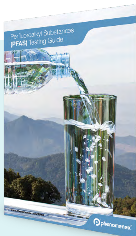
Complete PFAS Testing Guide

The two culprits are often the methanol and the lab consumables. Be sure to use high grade methanol from a reputable source, as well as high grade ammonium acetate. Some vendors have cleaner methanol than others, it is recommended that you test each lot before using. Also, the gases used for the LC-MS/MS can be another source of contamination. With respect to consumables, we wary of any consumables that are advertised as “low binding” or “low retention” as these often contain PFAS.